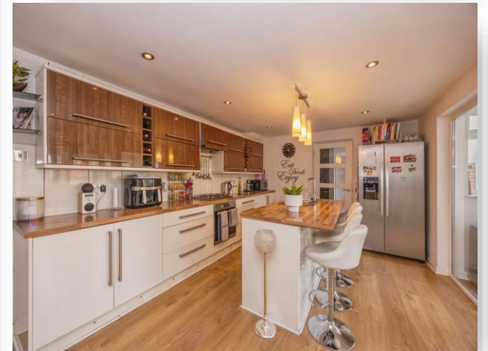
Forest End, Waterlooville PO7 7AB