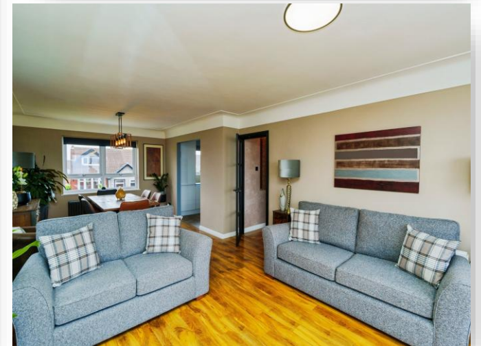
Redstone Park, Wallasey, CH45 9NB