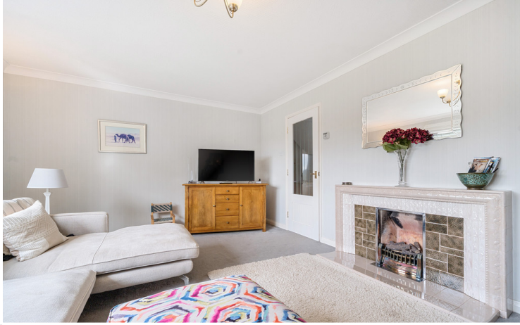
Living Room (6a)