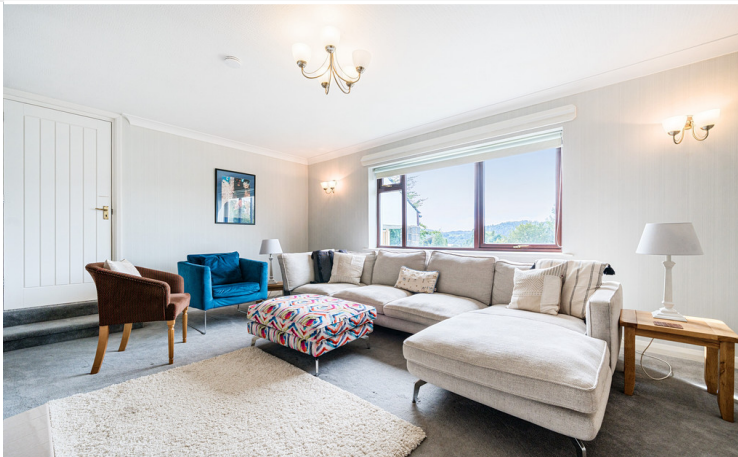
Living Room (6a)