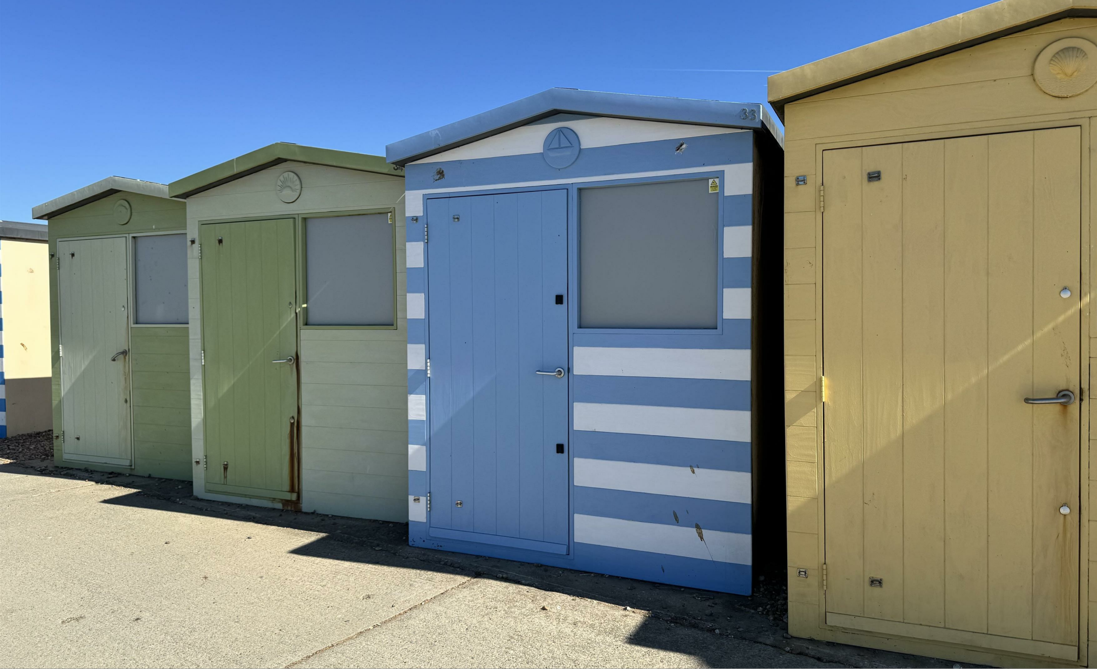
33 The Beach Hut Esplanade, Seaford, BN25 1JL