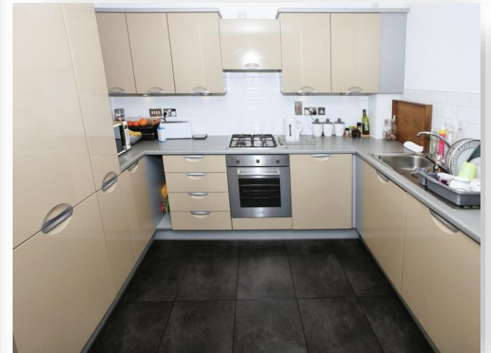
Hammonds Drive, Peterborough PE1 5AX