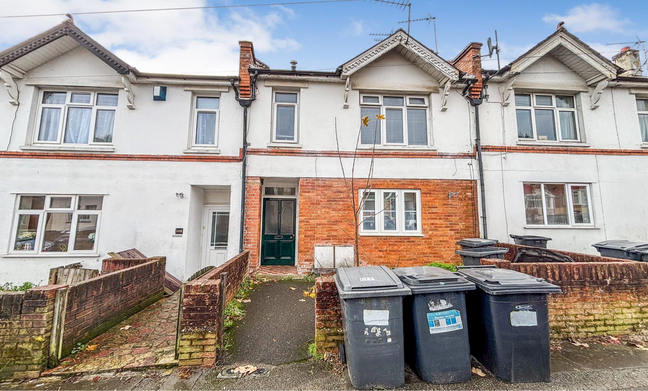
First Floor Flat Hankinson Road,Bournemouth BH9 1HR