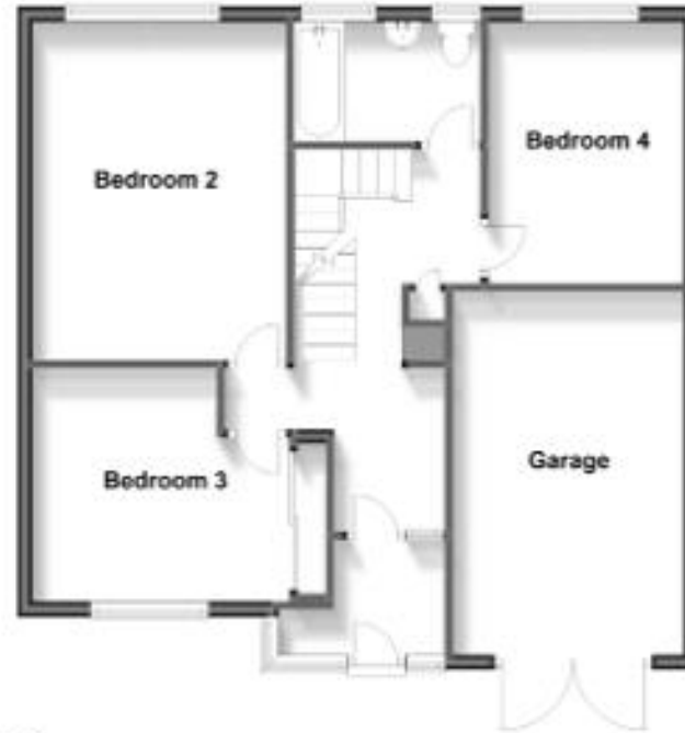
First Floor Approx. 26.1 sq. metres (281.2 sq. feet)