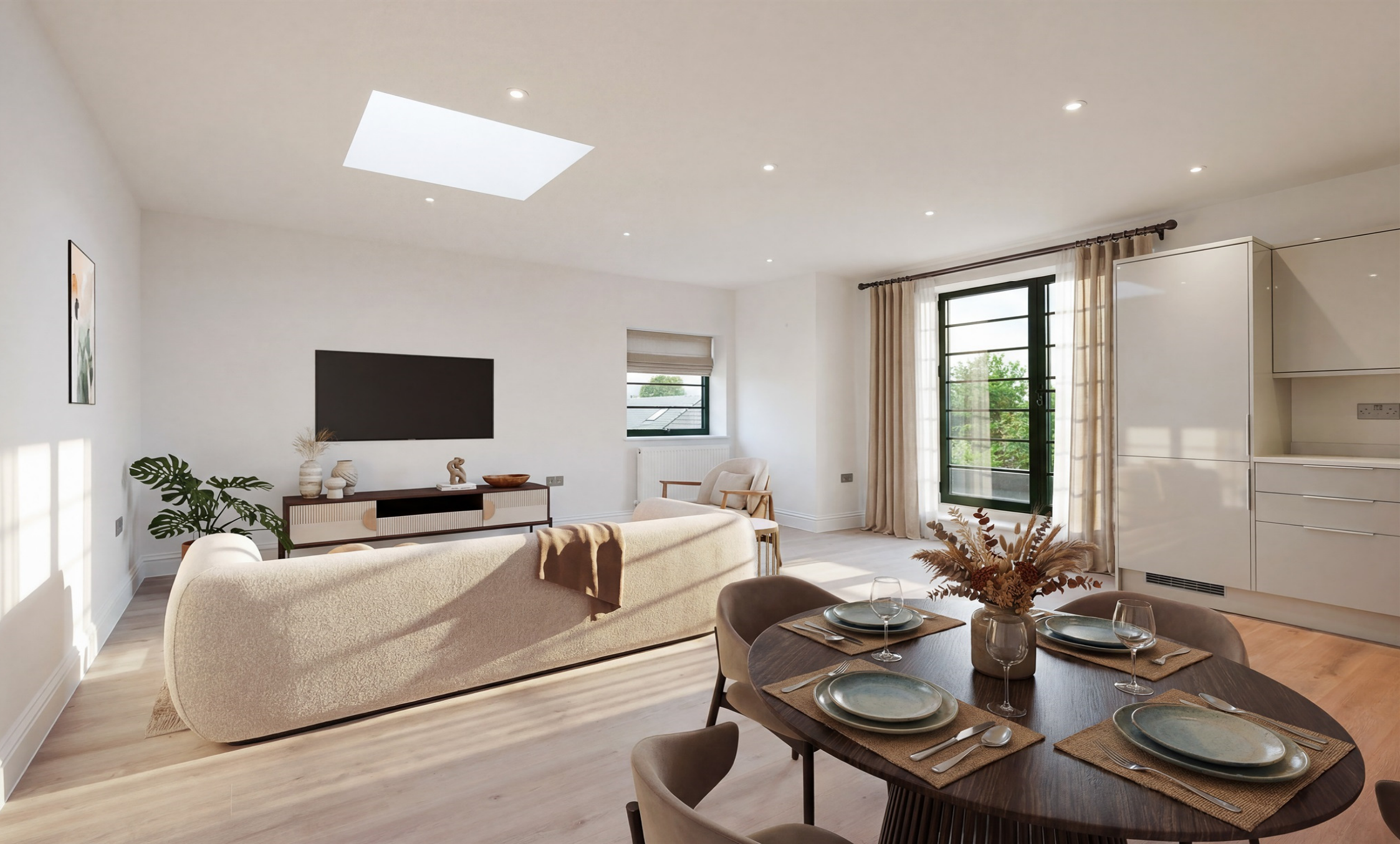
Avon Court, Barton Green, New Malden, KT3 3HU

Not for marketing purposes INTERNAL USE ONLY