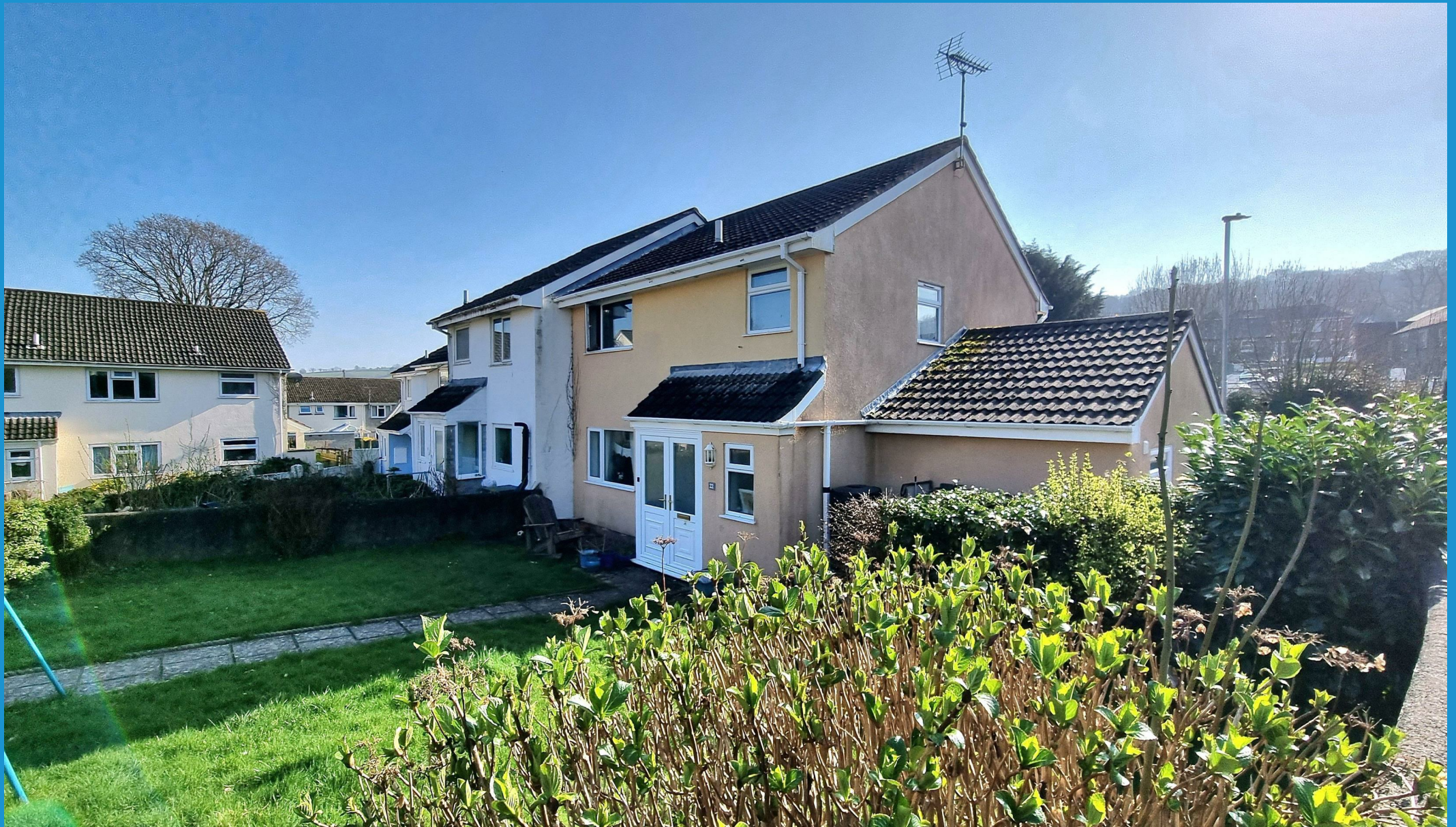
Arundell Gardens Lifton | Cornwall