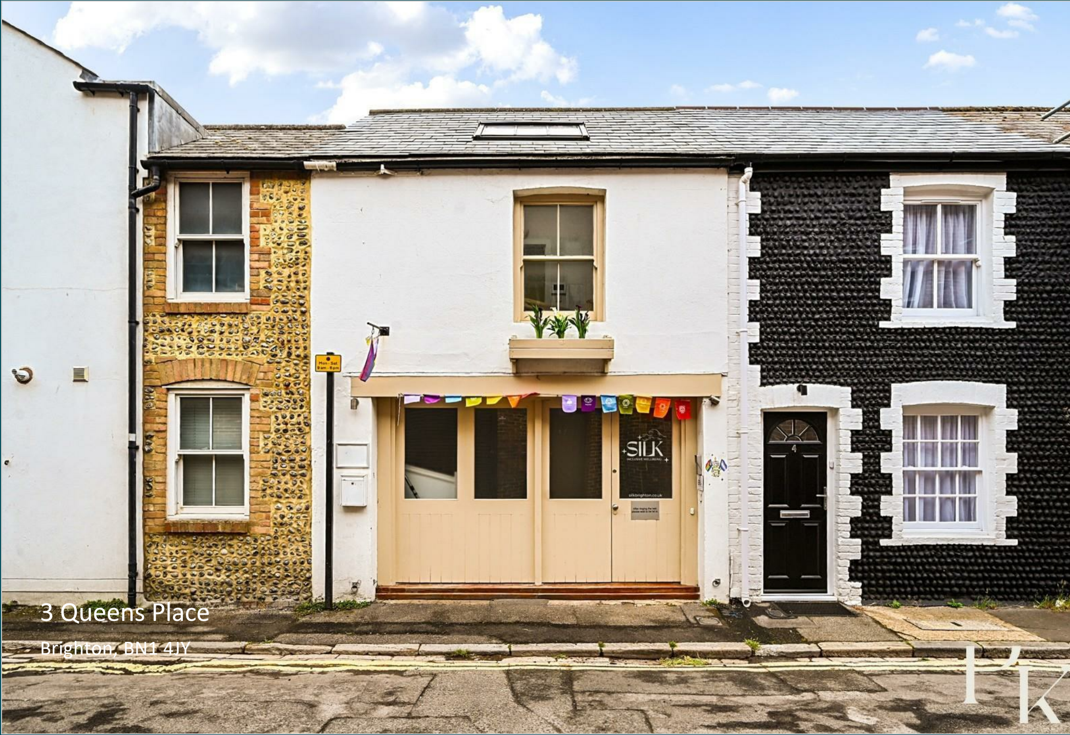
3 Queens Place Brighton, BN1 4JY