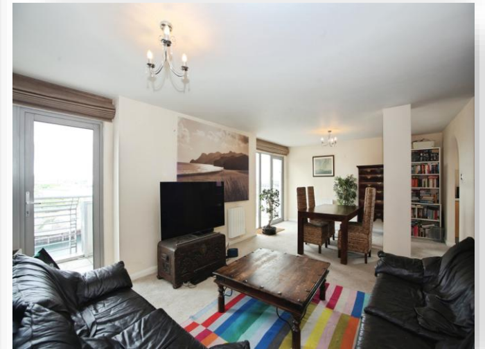
Ty Gwalia, Pierhead View, Penarth, CF64 1SJ