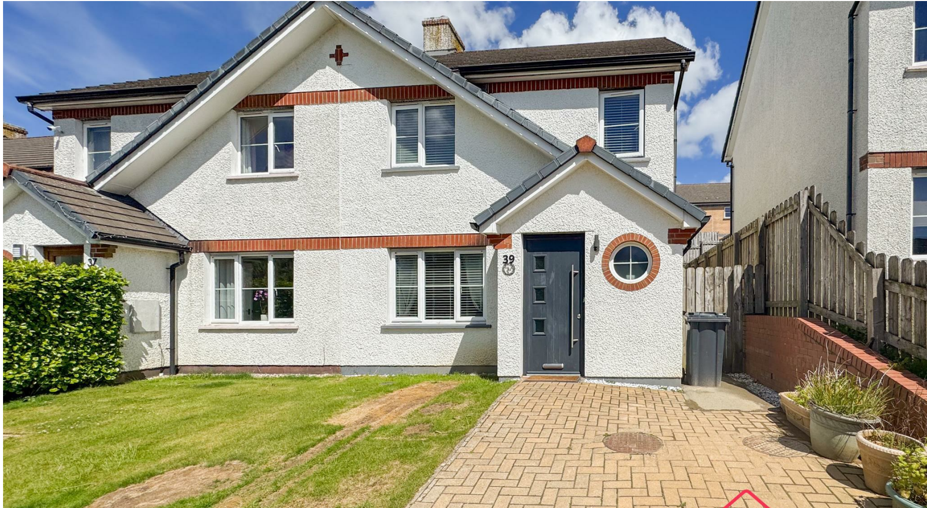
39 Samuel Webb Crescent, Douglas, Isle Of Man, IM2 6PP Asking Price £397,500