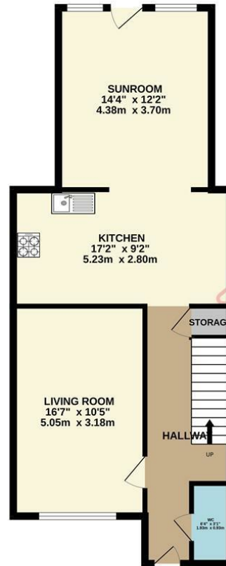
GROUND FLOOR 642 sq.ft. (59.6 sq.m.) approx.