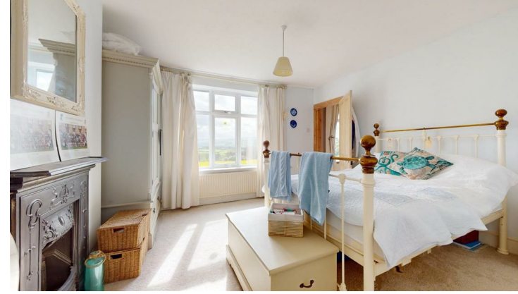
BEDROOM ONE 4.19m x 3.86m (13'9 x 12'8)

Ornate cast iron fireplace, double glazed window with splendid views in a west and southerly direction along the vale, panelled radiator.