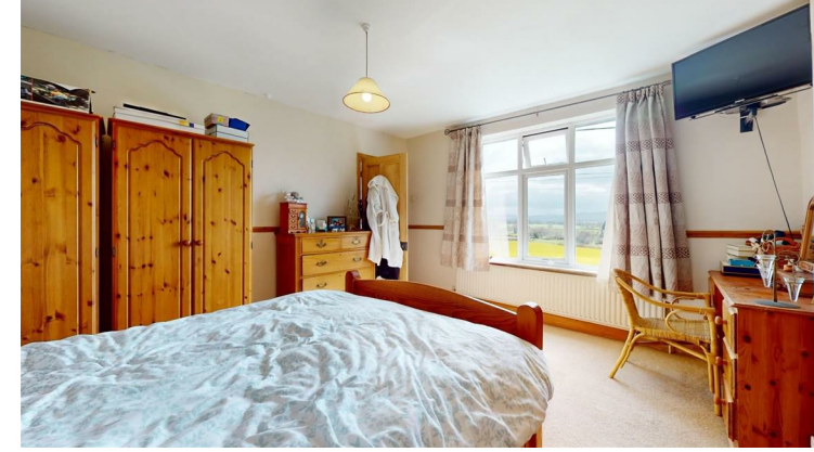
BEDROOM THREE 4.14m x 3.23m (13'7 x 10'7)

Double glazed window, panelled radiator.