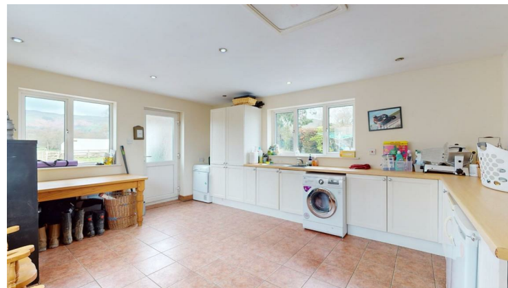
UTILITY ROOM 5.38m x 4.09m (17'8 x 13'5)

A very spacious room to the rear of the house with three double glazed windows, one of which affords far reaching views towards Moel Famau and the Clwydian Hills, it has a range of fitted base units with wood grain effect working surfaces and inset single drainer sink, plumbing for washing machine and space for fridge and freezer. Matching flooring to hall, double glazed door leading out.