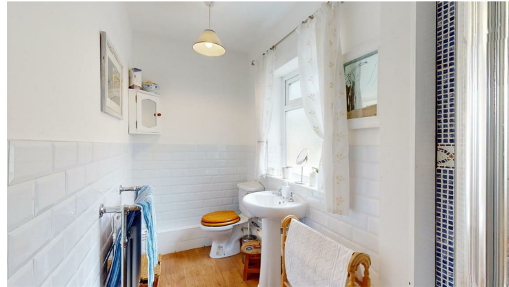
SHOWER ROOM 3.28m x 1.42m (10'9 x 4'8)

White suite comprising corner cubicle with electric shower, pedestal wash basin and WC, part tiled walls, double glazed window, wood grain effect floor finish, chrome towel radiator.