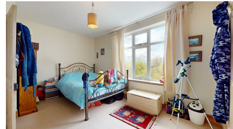
BEDROOM FOUR 4.50m x 3.12m (14'9 x 10'3)

Double glazed window, fitted double door wardrobe with high level shelf and cupboard above, panelled radiator.