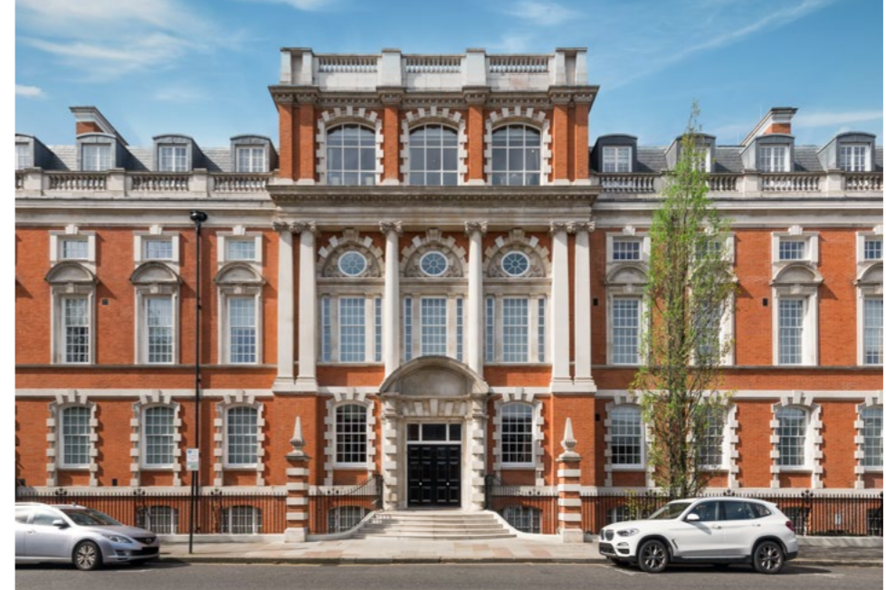
An outstanding five-bedroom apartment of approximately 6,649 sq ft, located at 21 Manresa Road in the heart of historic Chelsea, with a private west-facing garden, leading onto extensive communal gardens.