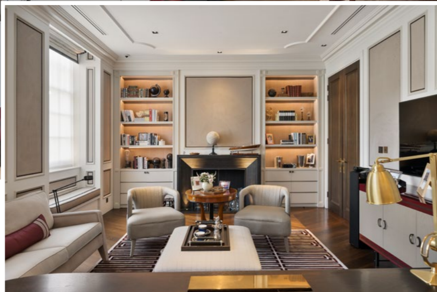
A private commission for the current owner by renowned architect and interior designer Finchatton, the apartment is fitted out to an exceptional standard of specification throughout, with full home automation, climate control, and rare natural materials.