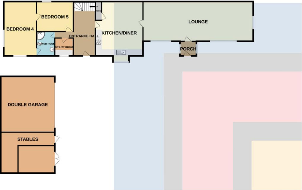
GROUND FLOOR 2216 sq.ft. (205.6 sq.m.) approx.