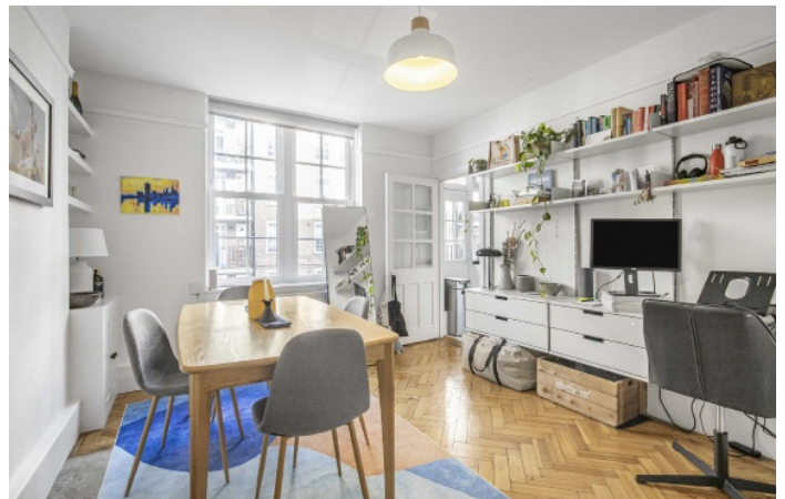
Sumner Street, SE1