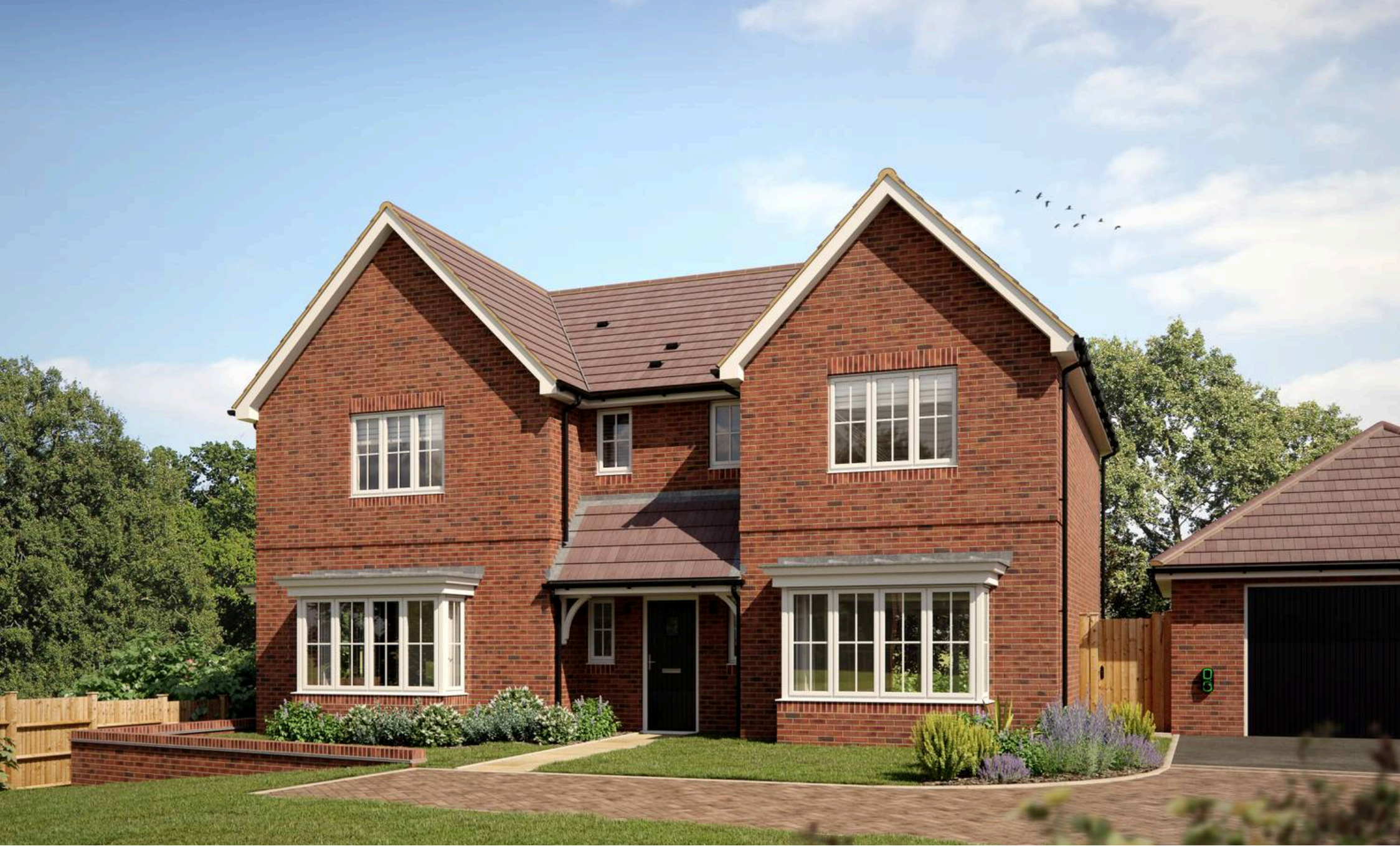
The Yew Plot 23, Restrop Road, Purton Swindon