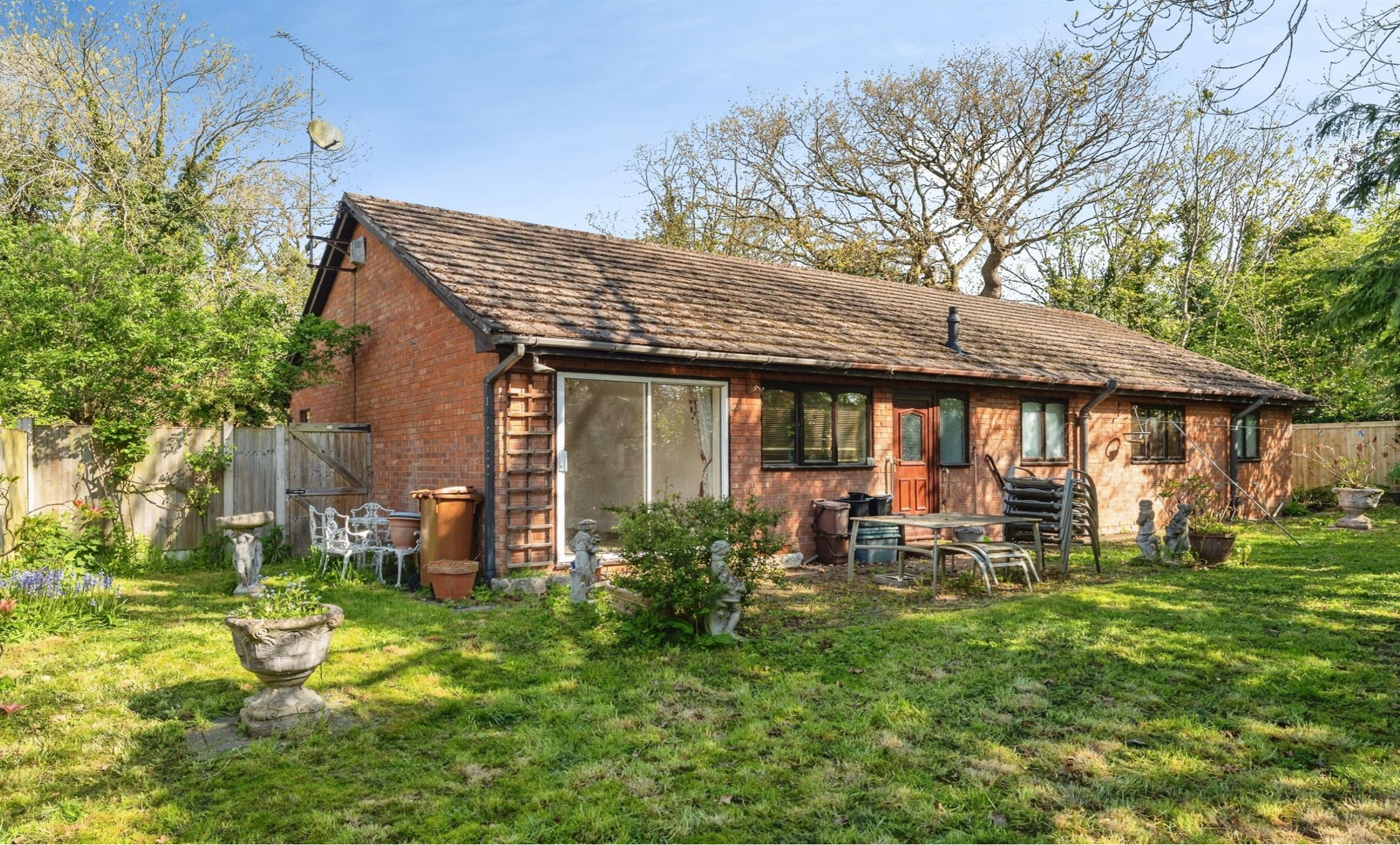
Woodbank Rawson Road, Blacon Chester CH1 5ND