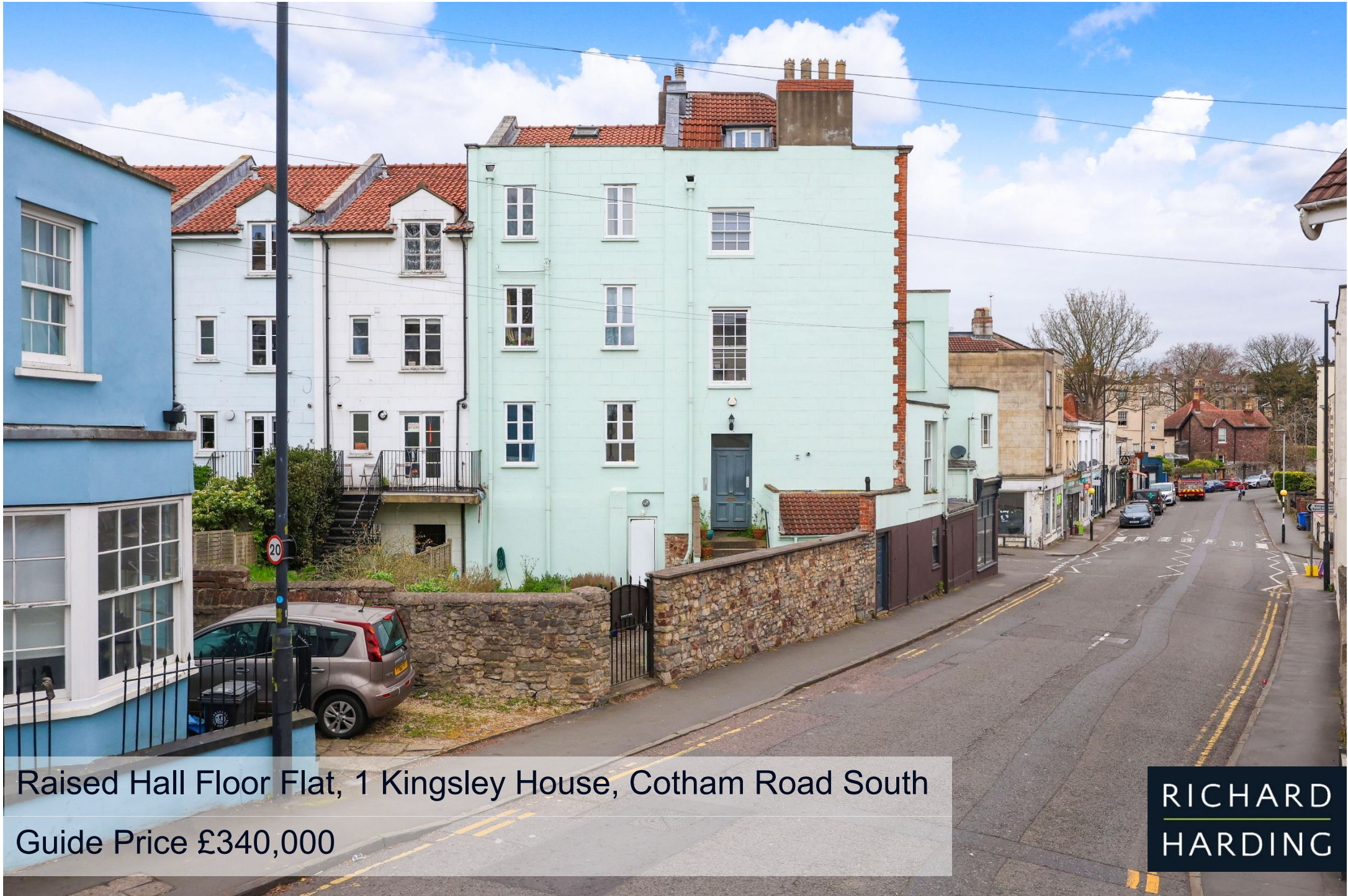
Raised Hall Floor Flat, 1 Kingsley House, Cotham Road South Guide Price £340,000