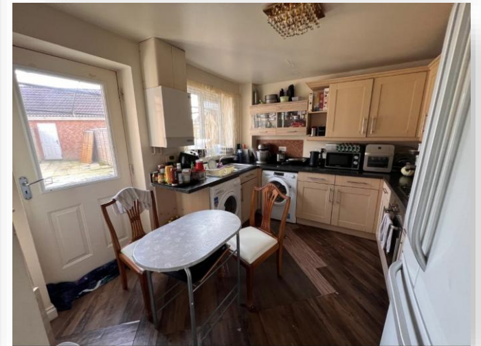
Maddren Way, Middlesbrough TS5 5BD