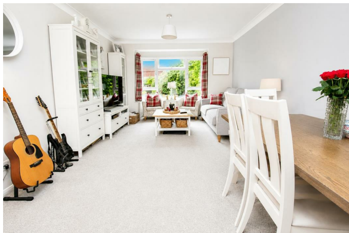
LOUNGE / DINER 19'9 x 11'11 (6.02m x 3.63m)