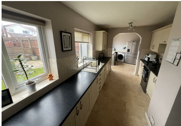
Luxury Fitted Kitchen