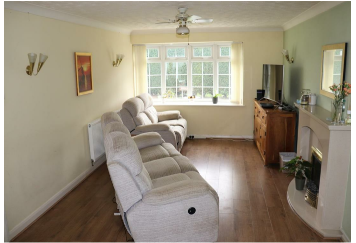
Lounge / Diner