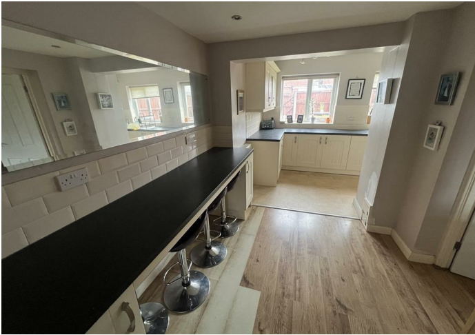
Luxury Fitted Kitchen