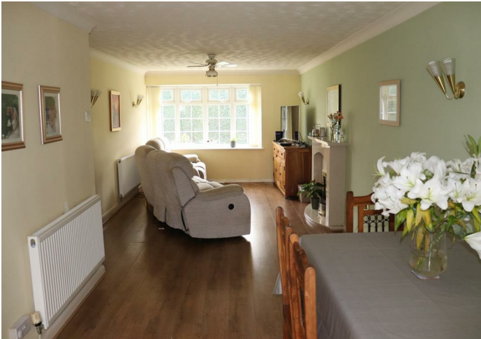
Lounge / Diner