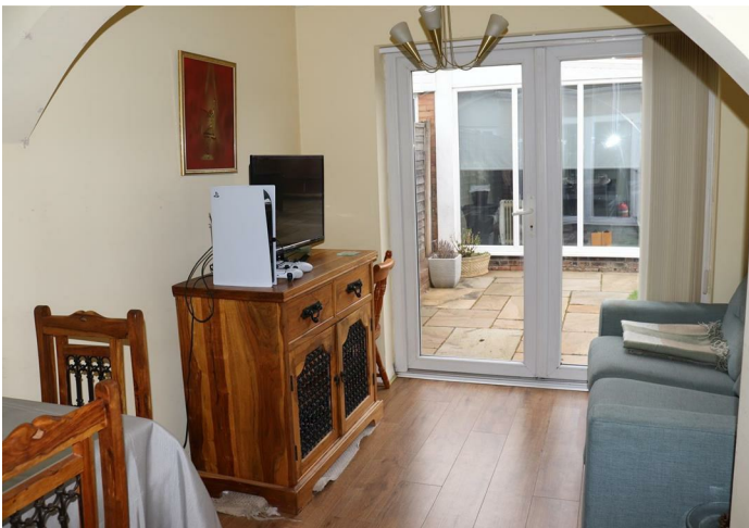
Lounge / Diner