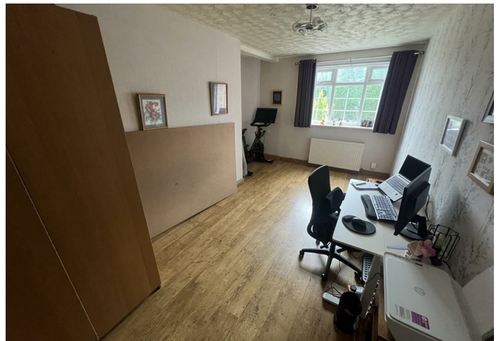
Sitting Room / Office