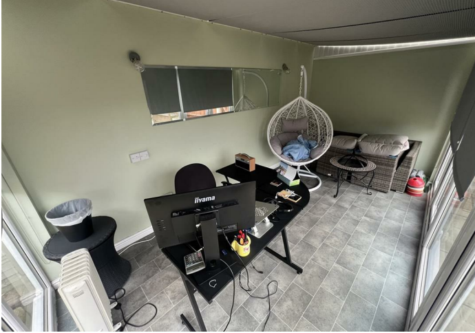
Detached Office / Garage