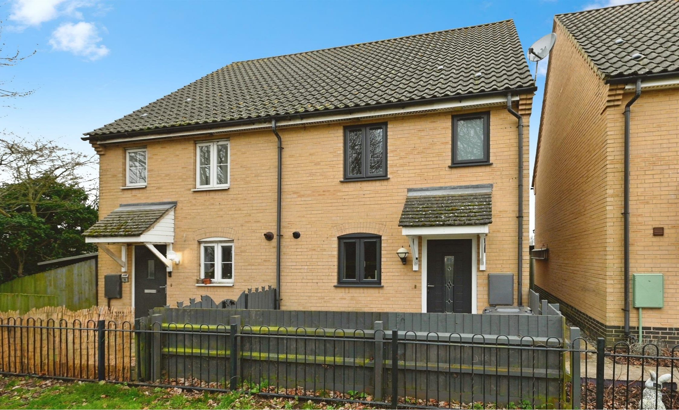
Poppyfields, West Lynn, King's Lynn, PE34 3LN