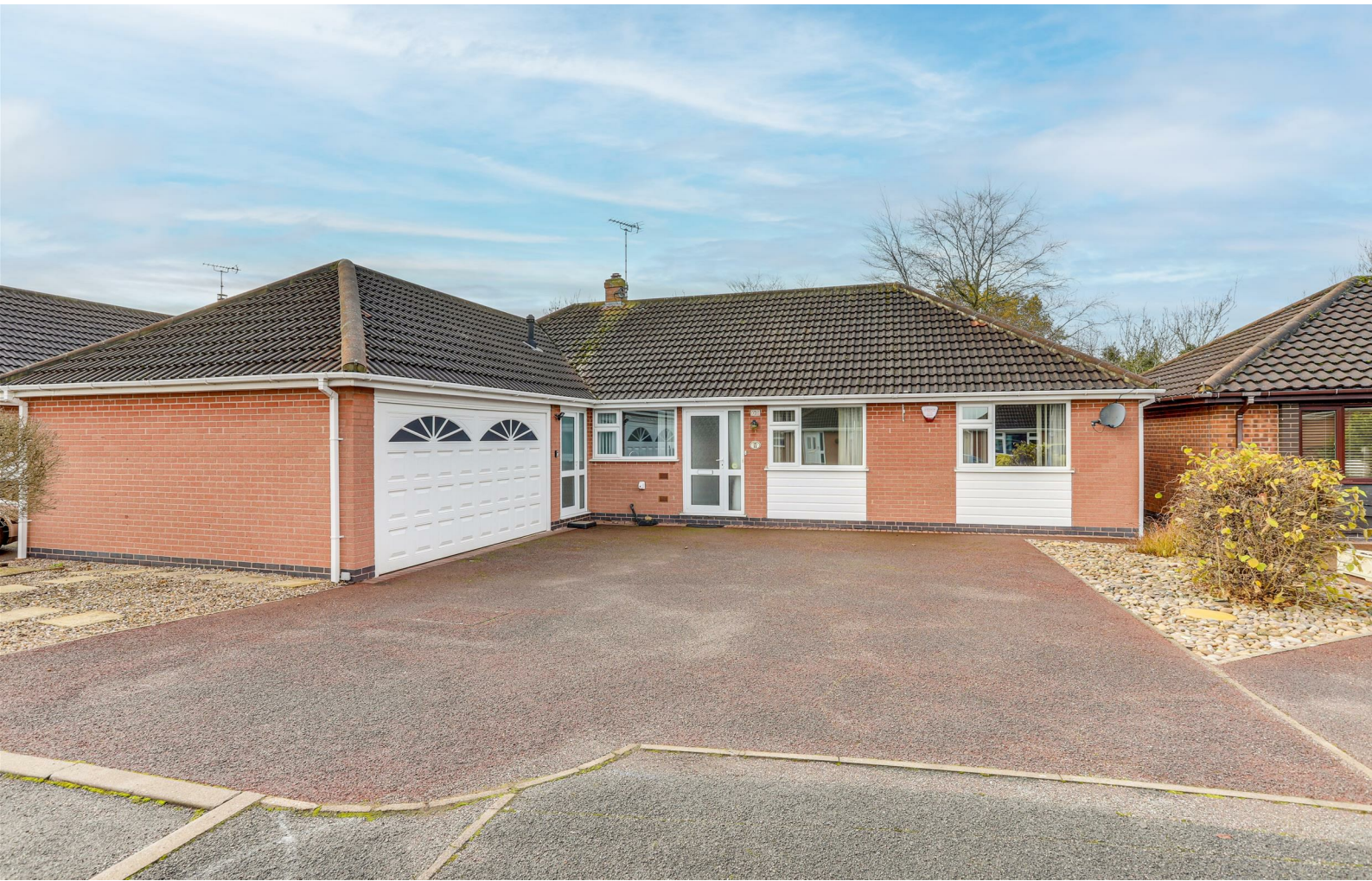
Heath Gardens, Breaston, Derbyshire DE72 3UH