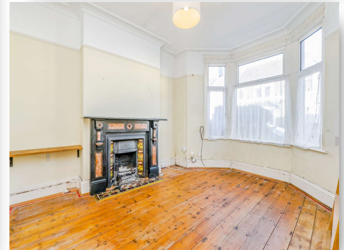
Carlisle Street, Splott Cardiff CF24 2PH