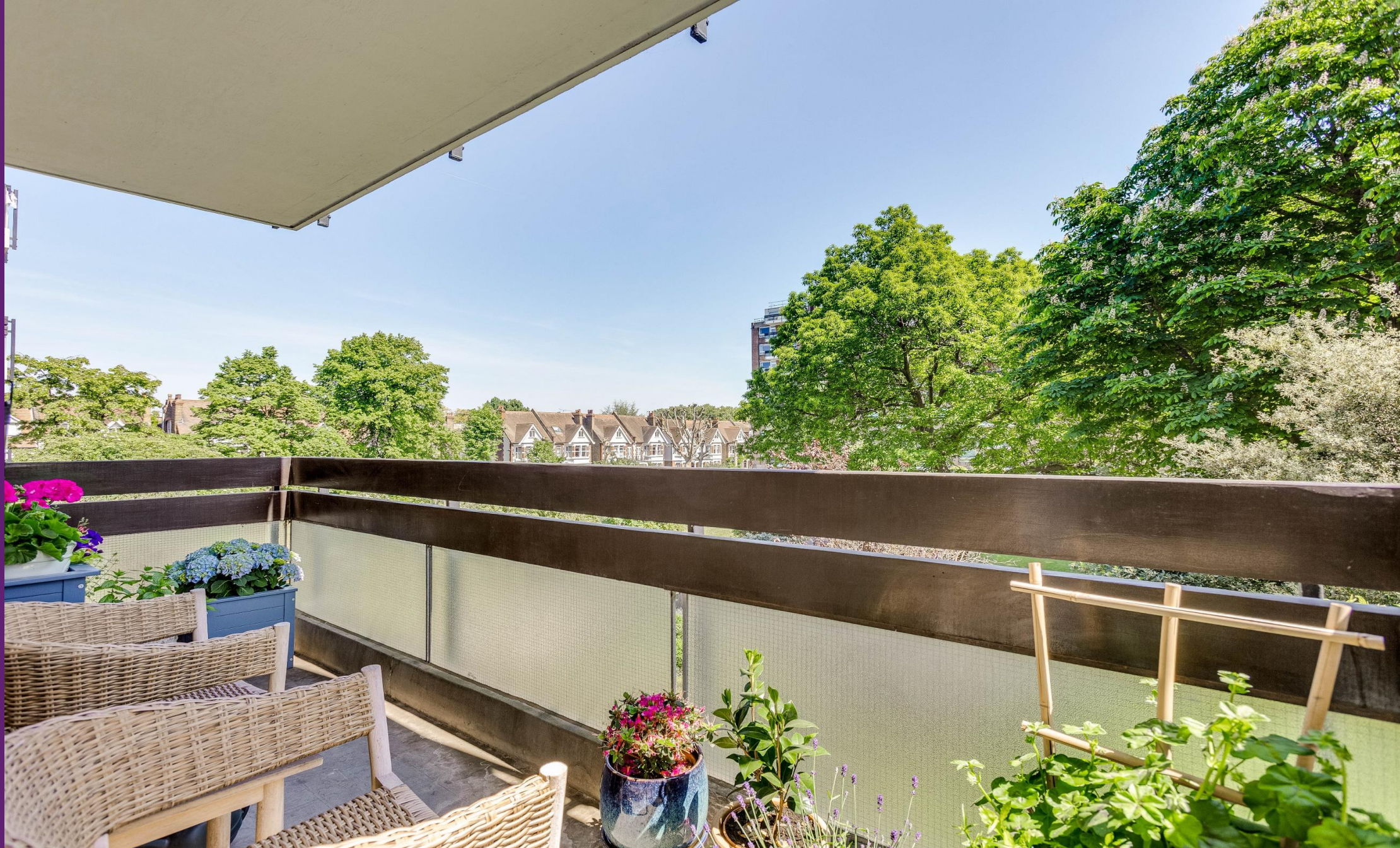
Napier Court Ranelagh Gardens, SW6