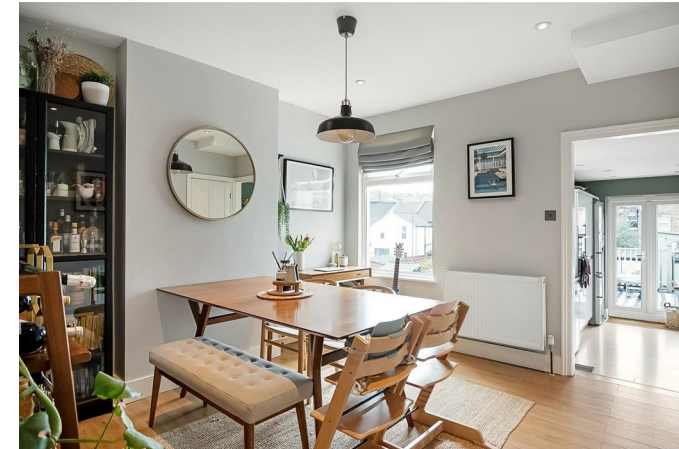
Hillside Avenue, CR8

Approximate Gross Internal Area 82.4 sq m / 887 sq ft