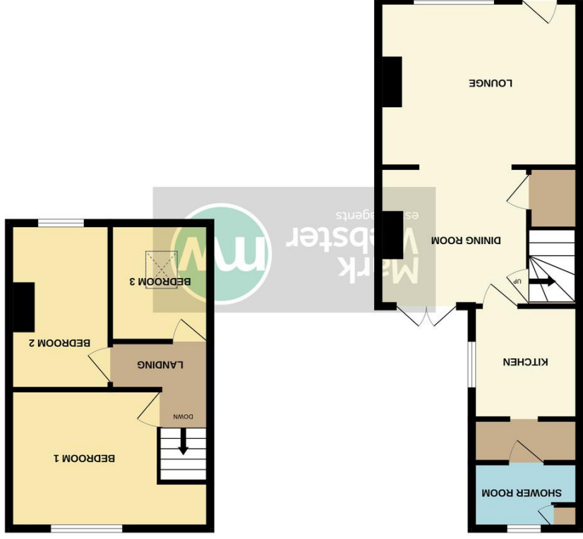
1ST FLOOR 313 sq ft (29.1 sq m) approx.