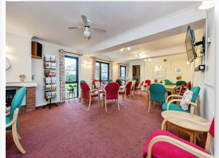
Aspley Court, Warwick Avenue, Bedford, MK40 2UH