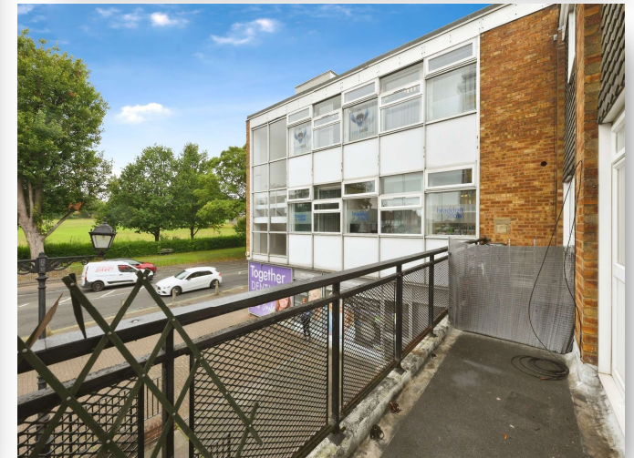
The Precinct, Broxbourne EN10 7HY