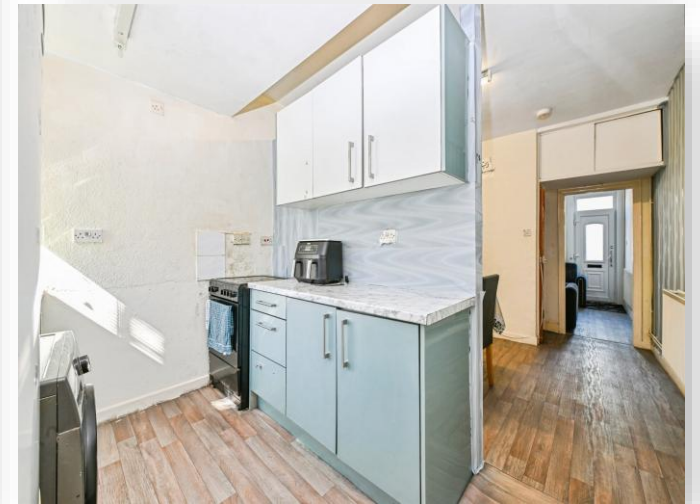
Lyndhurst Road, Nottingham NG2 4FX