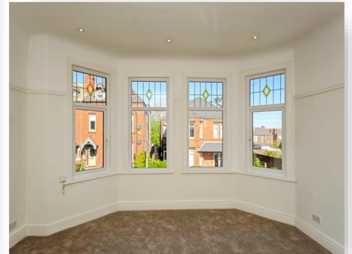
Warwick Drive, WALLASEY, CH45 7PJ