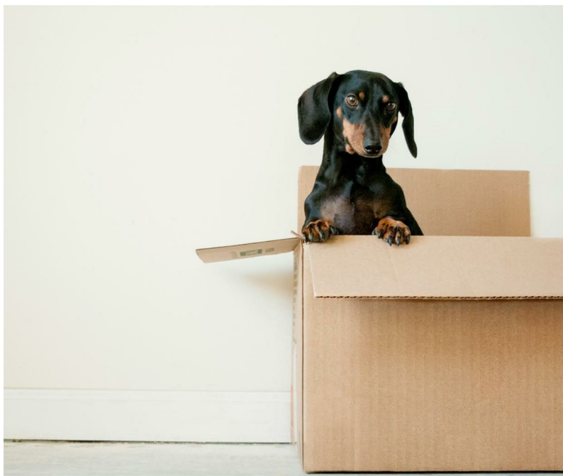
Wessex Grove, Malmesbury