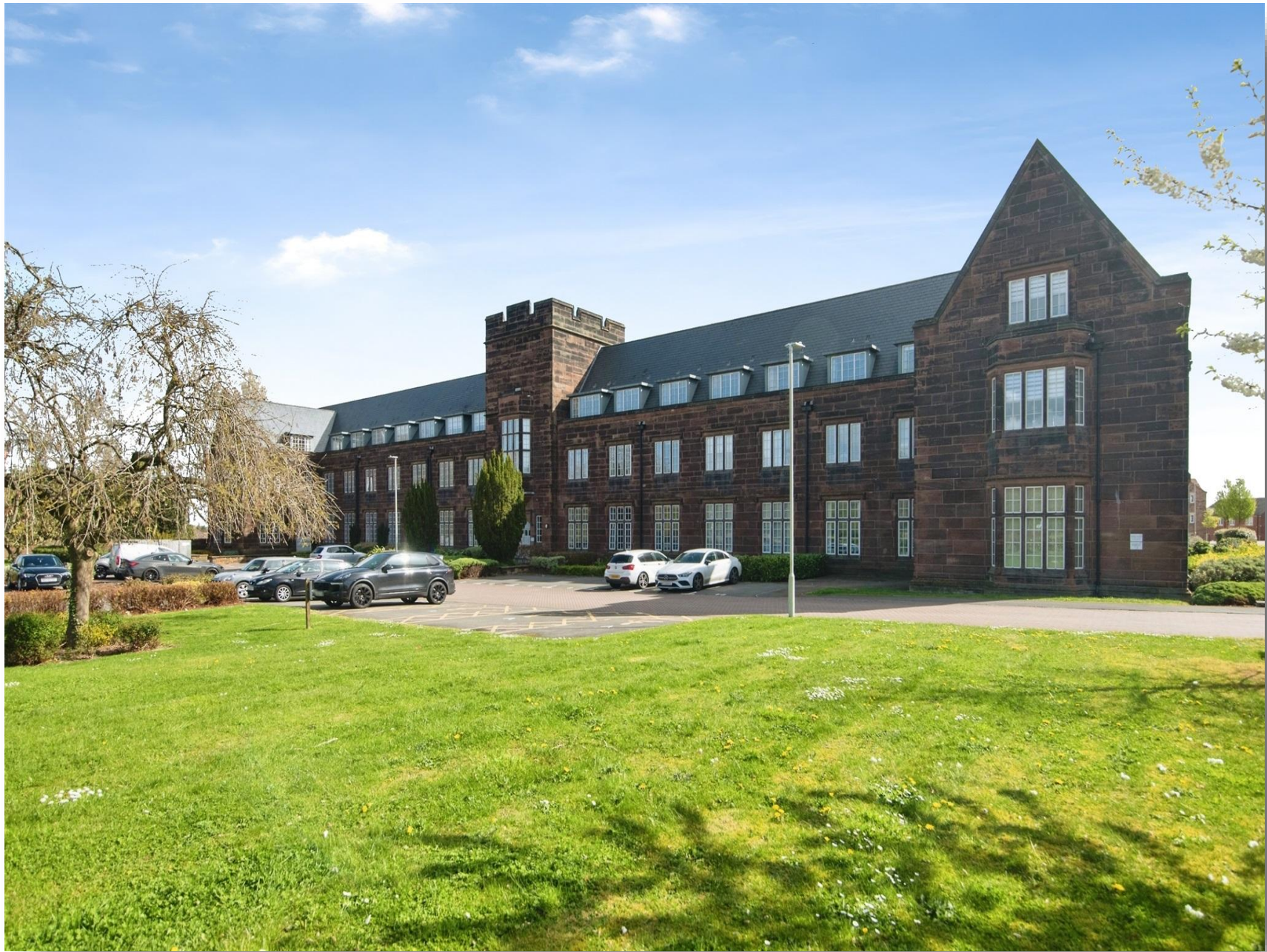
Bourne Hall Mallows Grove, DUDLEY DY1 4SU