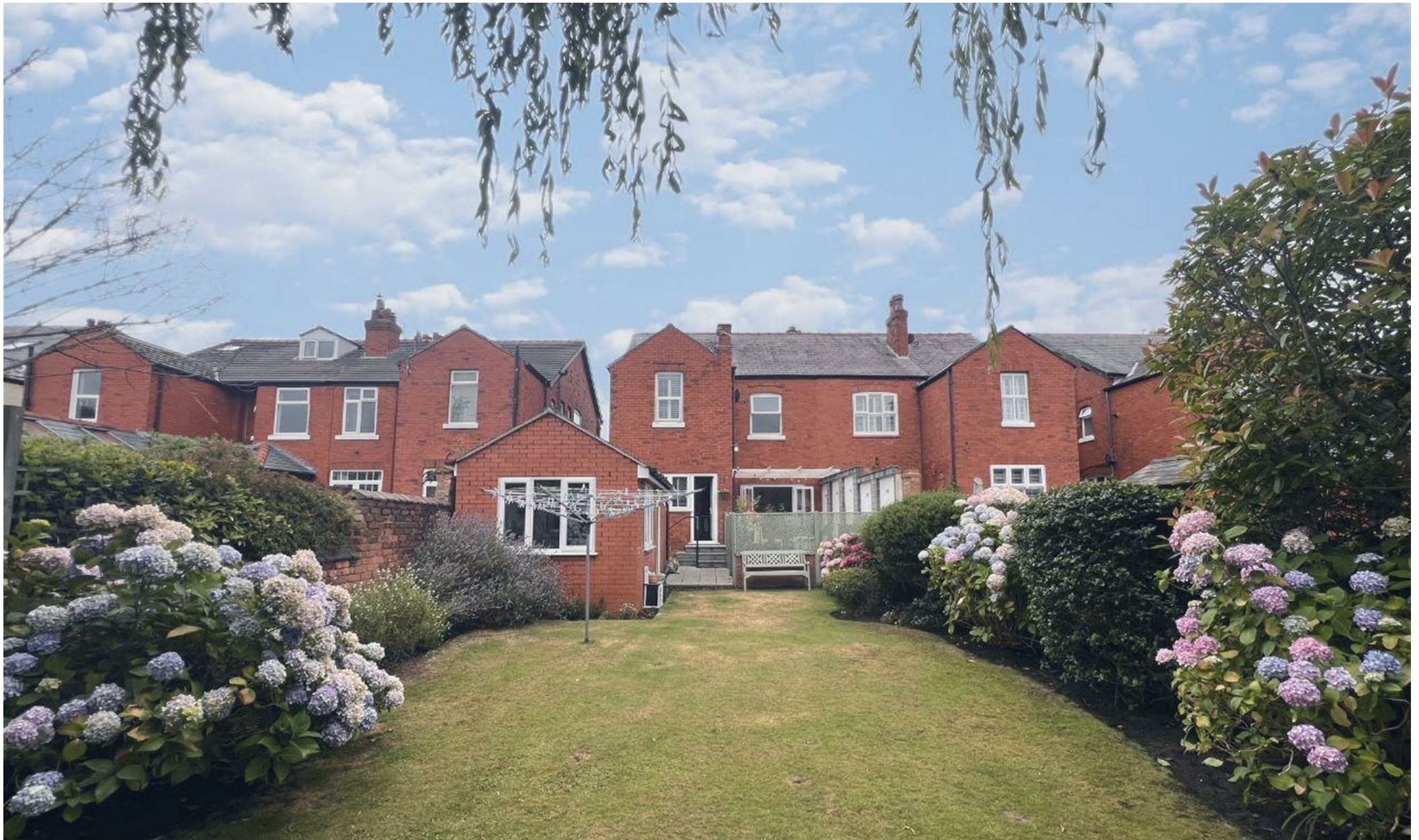
GOLF | CHARLOTTE HOUSE, GROUND FLOOR, 35-37 HOGHTON STREET, SOUTHPORT, MERSEYSIDE, PR9 0NS