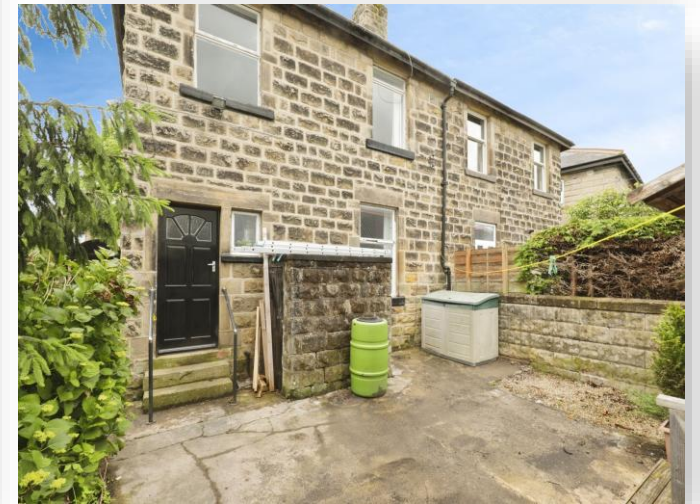
King Edwards Drive, Harrogate HG1 4HA