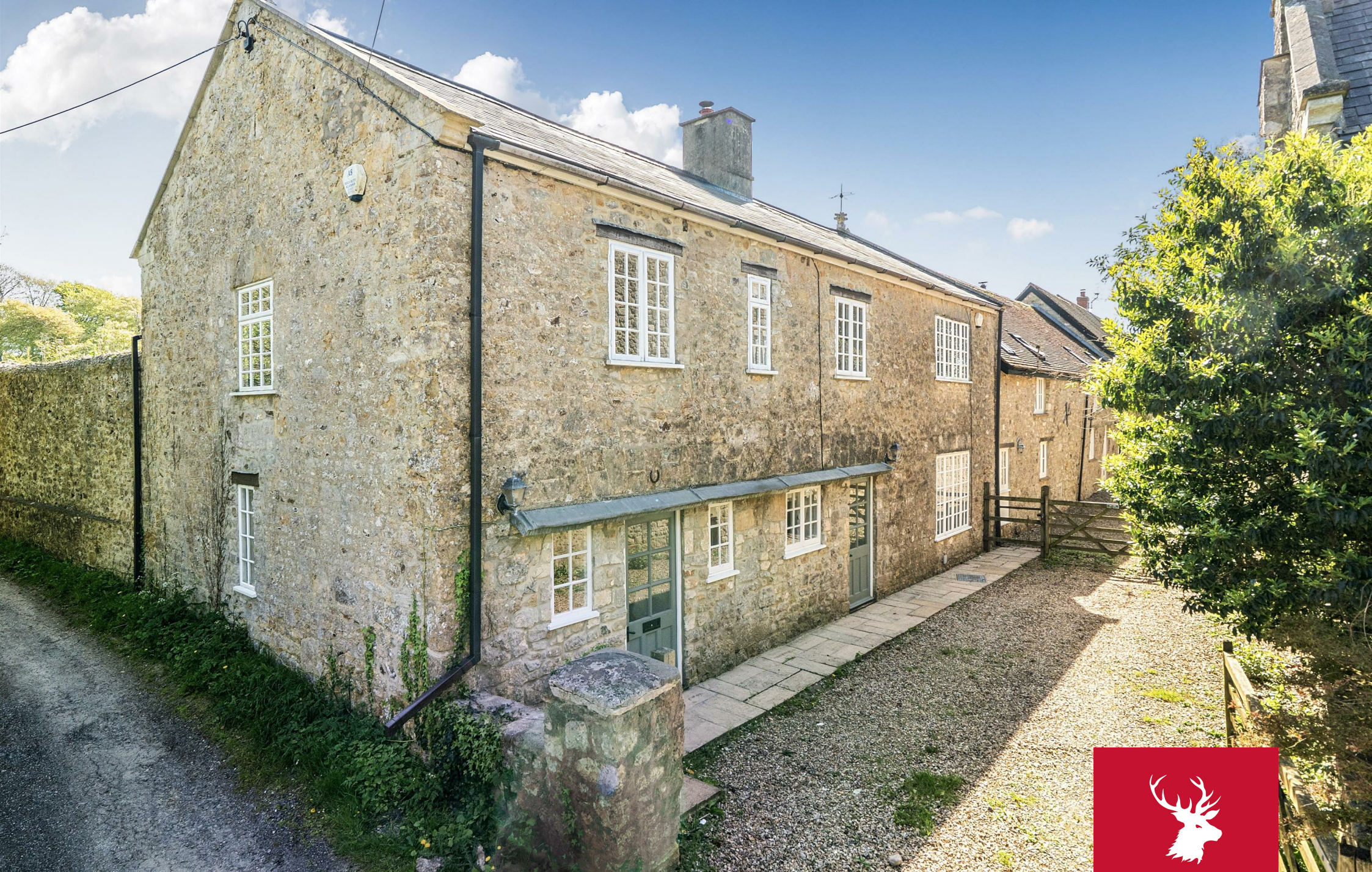
Dowlands Farm Cottage