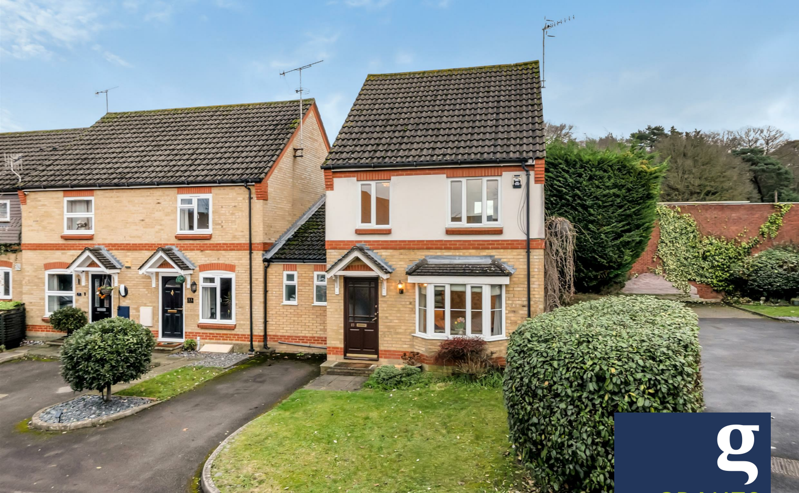
Fernihough Close, KT13 0UY