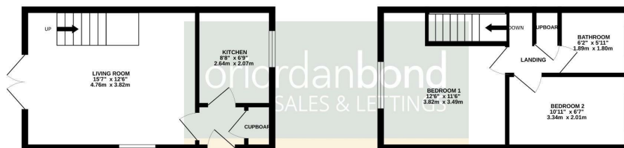
TOTAL FLOOR AREA : 592 sq.ft. (55.0 sq.m.) approx.

Whilst every attempt has been made to ensure the accuracy of the floorplan contained here, measurements of doors, windows, rooms and any other items are approximate and no responsibility is taken for any error, omission or mis-statement. This plan is for illustrative purposes only and should be used as such by any prospective purchaser. The services, systems and appliances shown have not been tested and no guarantee as to their operability or efficiency can be given. Made with Metropac (2020)