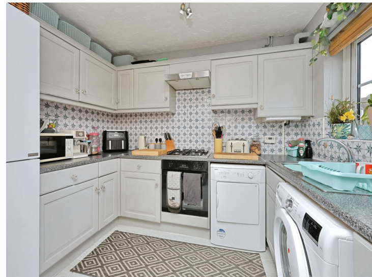
Helsinki Way, Dereham, NR19 1XU