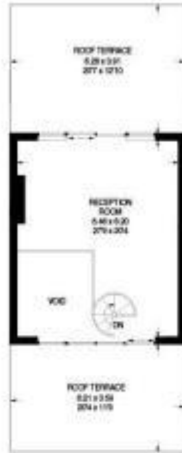
Second Floor (Excluding Void) 41.4 sq m / 446 sq ft

Illustration for identification purposes only, measurements are approximate, not to scale.