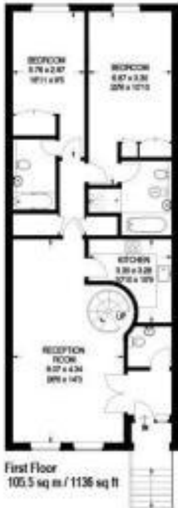
First Floor 105.5 sq m / 1136 sq ft