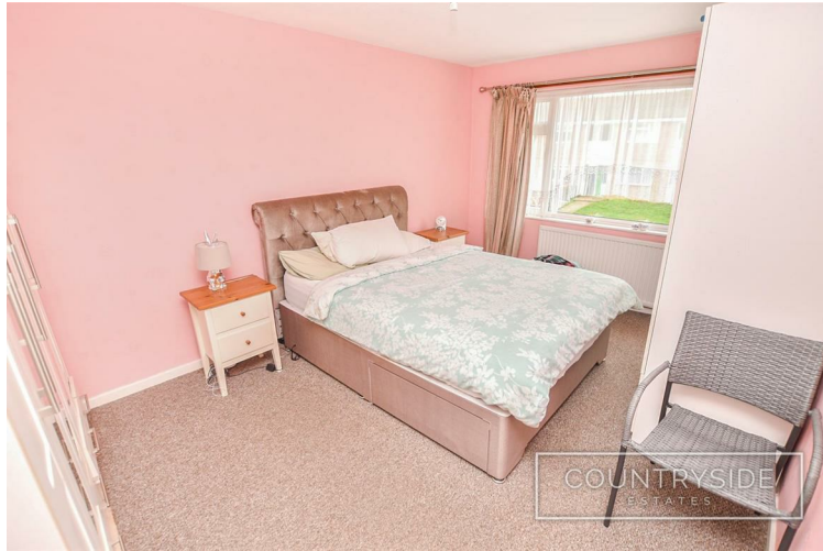
Bedroom One 14'9 x 10'2 (4.50m x 3.10m)

Upvc double glazed window to front aspect, carpet, artex ceiling, radiator and power points.