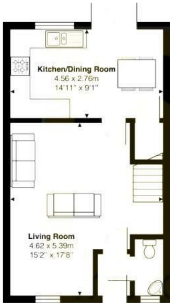
Ground Floor Area: 39.5 m 2 ... 425 ft 2