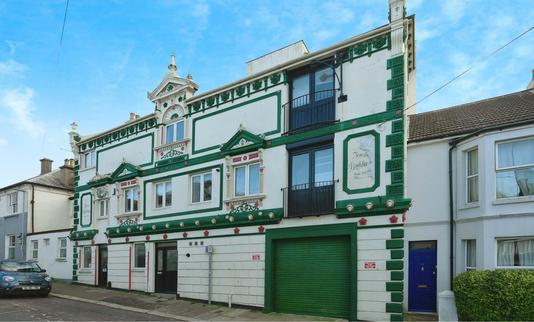
Tower Building Lower South Road, St. Leonards-On-Sea TN37 6RH