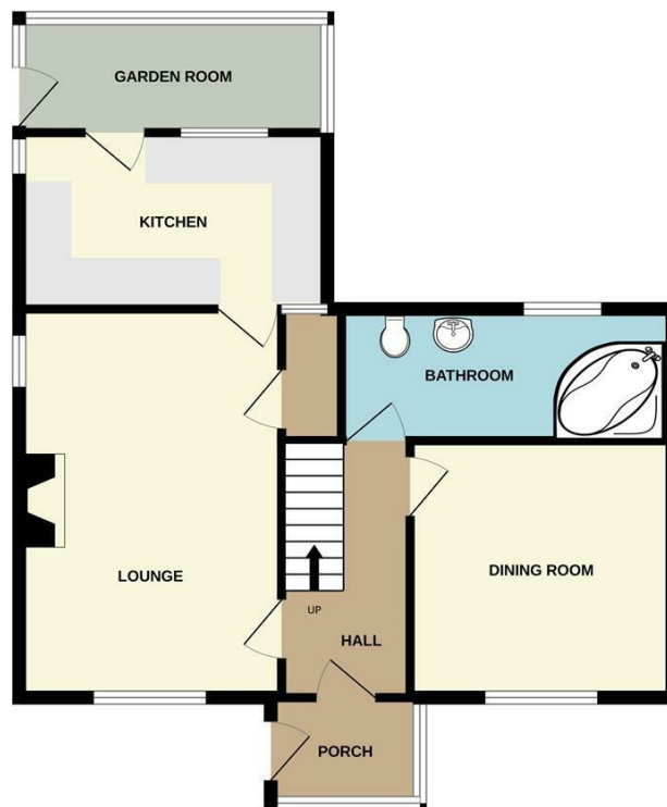
GROUND FLOOR 644 sq.ft. (59.8 sq.m.) approx.