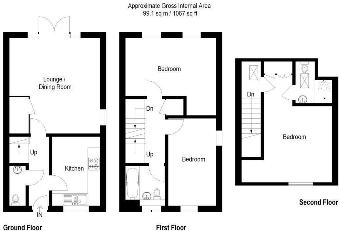
Illustration For Identification Purposes Only. Not To Scale (ID:165676 / Ref:48799)