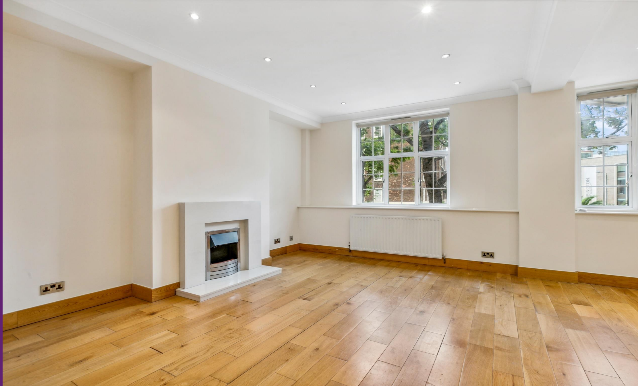
Kenton Court Kensington High Street, W14