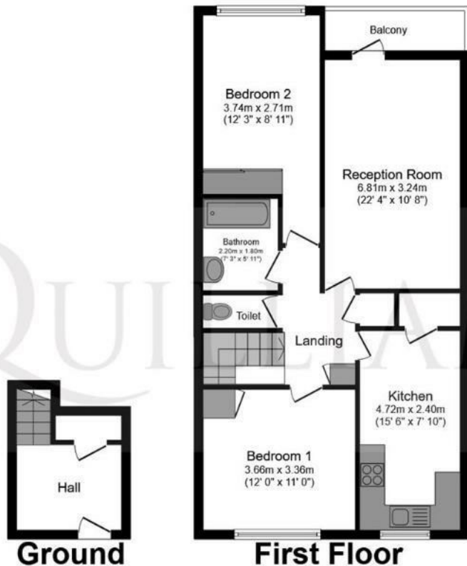
Ground Floor Floor area 7.4 sq.m. (79 sq.ft.) approx