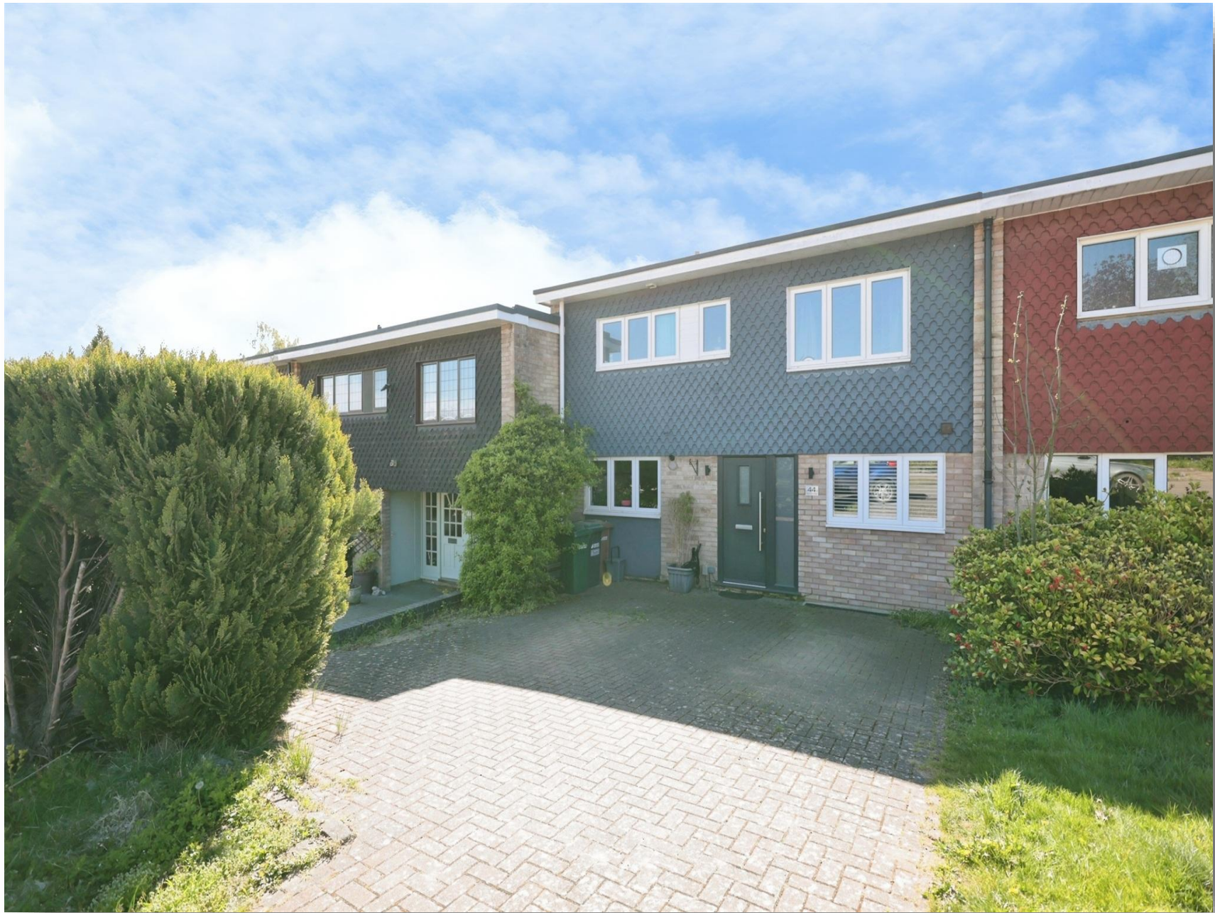
Sycamore Road, Croxley Green, Rickmansworth, WD3 3TD