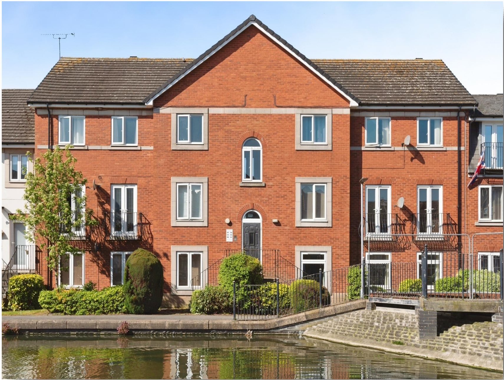
Ha'penny Bridge Way, Hull, HU9 1HD